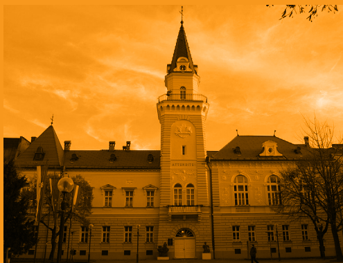
Kikinda City Hall