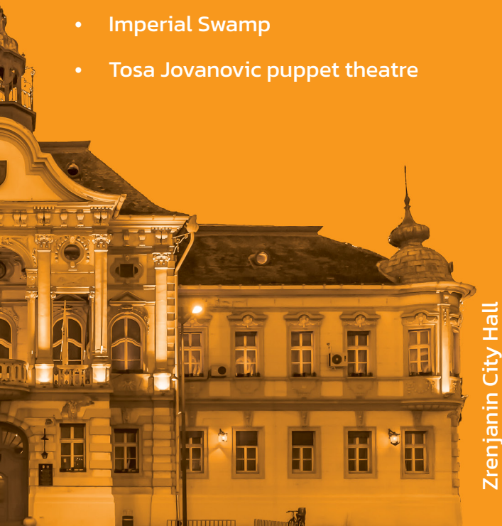
Zrenjanin City Hall