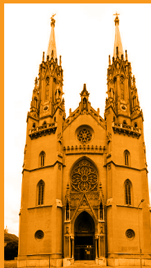
St Gerhard Cathedral

Rent Prices in Vršac are 53.19% lower than in Novi Sad Restaurant Prices in Vršac are 3.87% lower than in Novi Sad