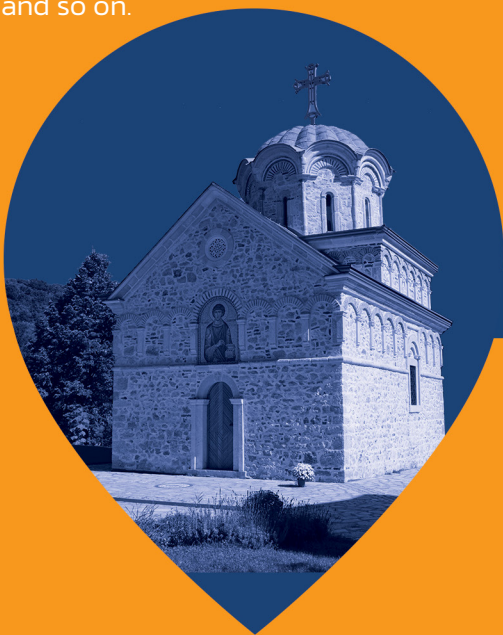
Staro Hopovo Monastery

The mountain is densely forested, with hundred-year-old oak and birch trees, as well as the linden, a tree revered by the Slavic people. The mountain, with its highest peak, Crveni ot 539 m (Red Cot), and much of its surroundings are part of a national park that spans 25.000 ha. This mountain appears to have evolved from the cultivated Vojvodina Plain. It offers numerous opportunities for hiking and biking tours, as well as numerous interesting trails.