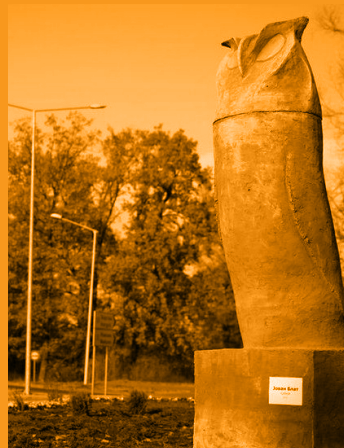
Owl statue in the city centre