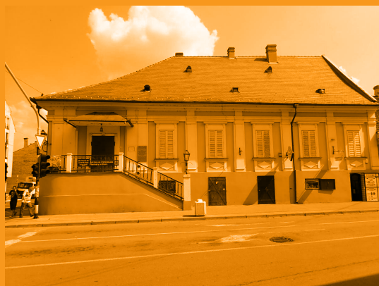
Pharmacy On Stairs